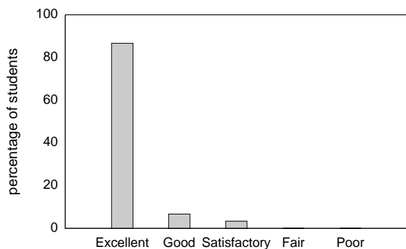
Figure 3: Histogram of student feedback on the experience of using the Python-NLTK combination.

Since this was our first major revision of the curriculum for an introductory NLP course, we were interested in getting student feedback on the changes that we made. To elicit such feedback, we designed a survey that asked all the students in the class (a total of 30) to rate the new curriculum on a scale of one to five on various criteria, particularly for the experience of using NLTK for all programming assignments and on the quality of the assignments themselves.